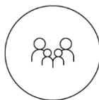
Great for families