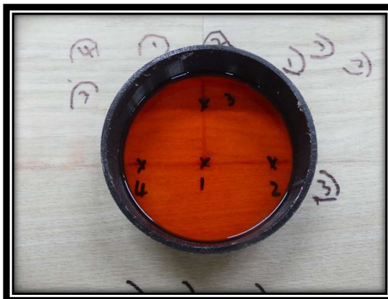
24 Hrs with Water