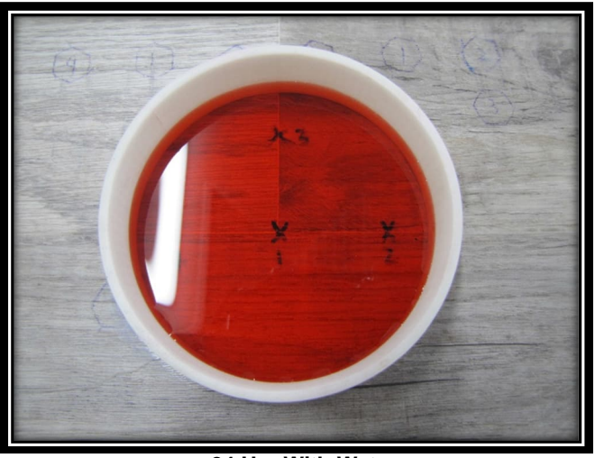
24 Hrs With Water

This ISO test method is used internationally and has been independently performed in New Zealand. The result of this test verified that this product's assembled joint over a 24 hour period did not allow water penetration through to the substrate, or if tested at the edges where edge sealant has been applied.